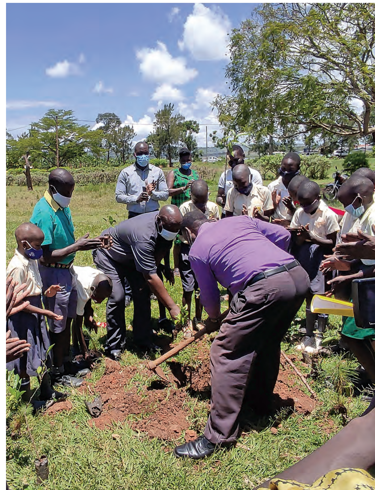
The head teacher and pupils of Prisons Primary School plant trees at school during a Multi-Stakeholder Environmental Conservation Sensitization program organized by the Nile Basin Discourse Forum on Nile Day 2021 in Jinja, Uganda.

Today, CIWA’s new Nile Cooperation for Climate Resilience (NCCR) project is stepping up CIWA’s strategic engagement to strengthen climate resilience in the Basin.