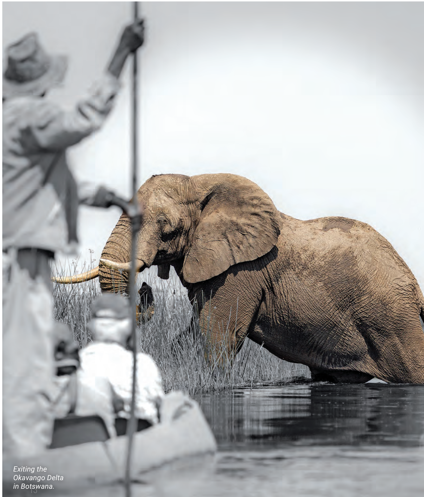
Exiting the Okavango Delta in Botswana.

O ur lives and economy depend on our natural capital. Whether rural Africans can sustain their livelihoods by working in agriculture, fishing or the wildlife and tourism sector depends on the health of rivers and other freshwater ecosystems that support biodiversity.