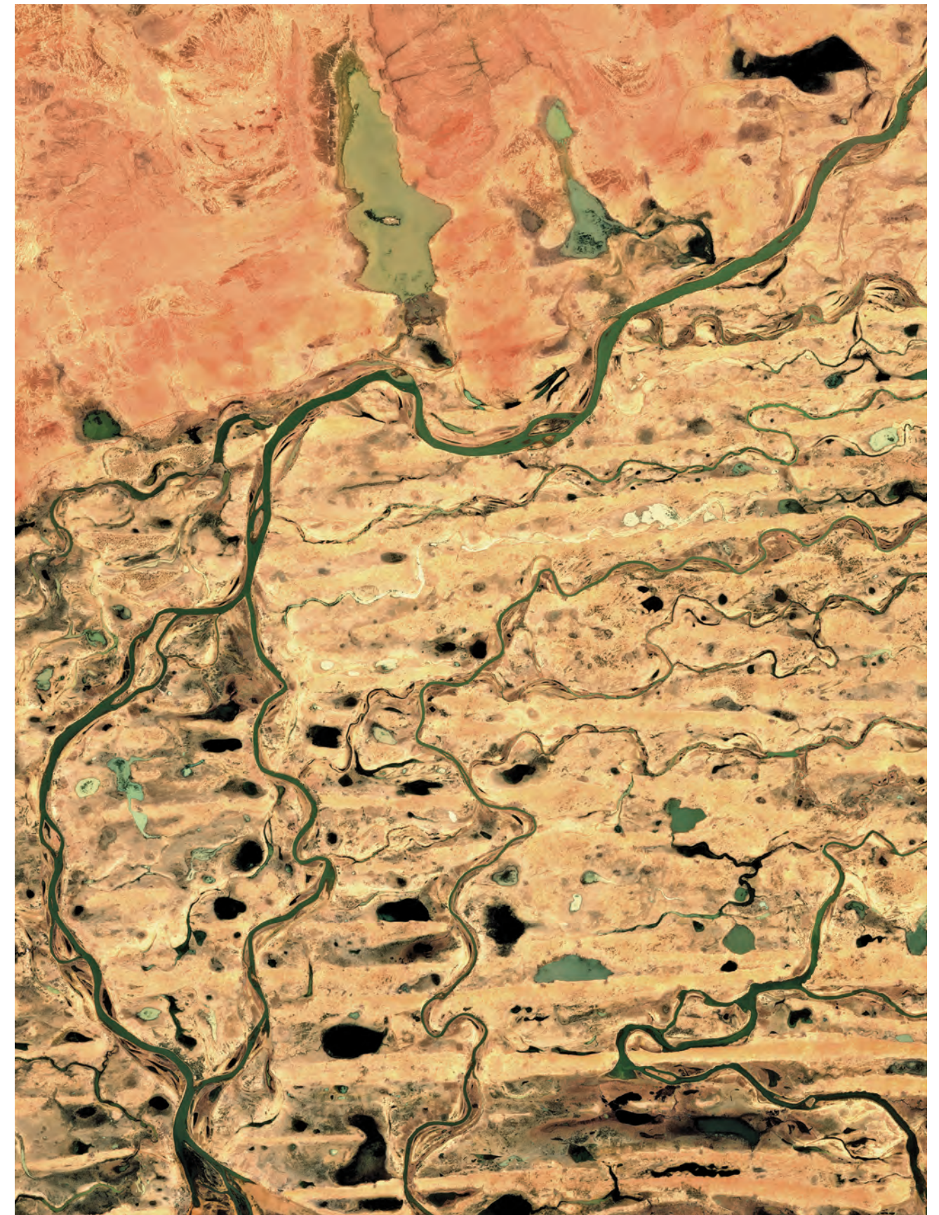
Niger River and Inner Niger Delta in Mali seen from space - contains modified Copernicus Sentinel Data (2019).

As Toure, the Guinean fisherman says, “We have to increase efforts to restore the degraded banks and protect natural areas because the Delta is a source of growth for Mali as a whole and not just in the Delta.”