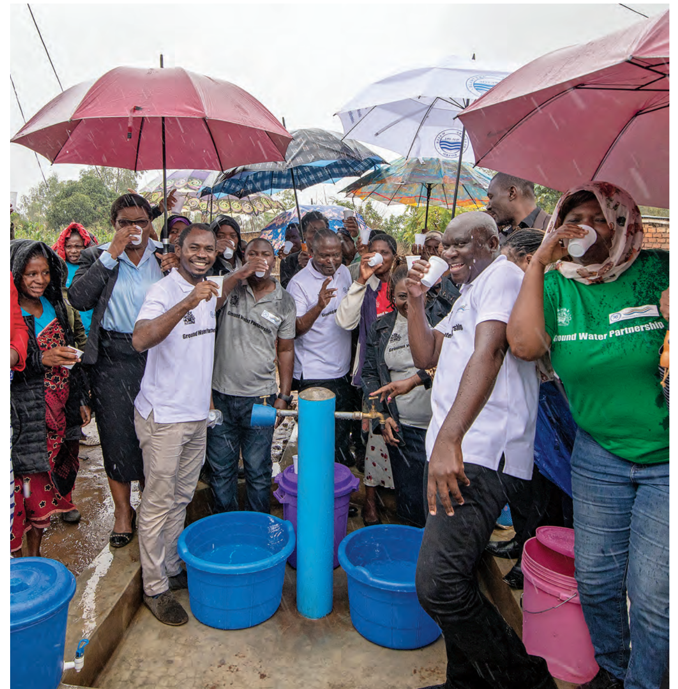
The Chimbiya community tasting fresh and safe water from one of the SADC-GMI's projects, the Chimbiya Water Supply Project, in March 2020, in Dedza District, approximately 60 km from Lilongwe, Malawi.

"It was really challenging growing up," he says. He wants to help people in communities today to have access to safe water that never dries up—and he just might succeed.