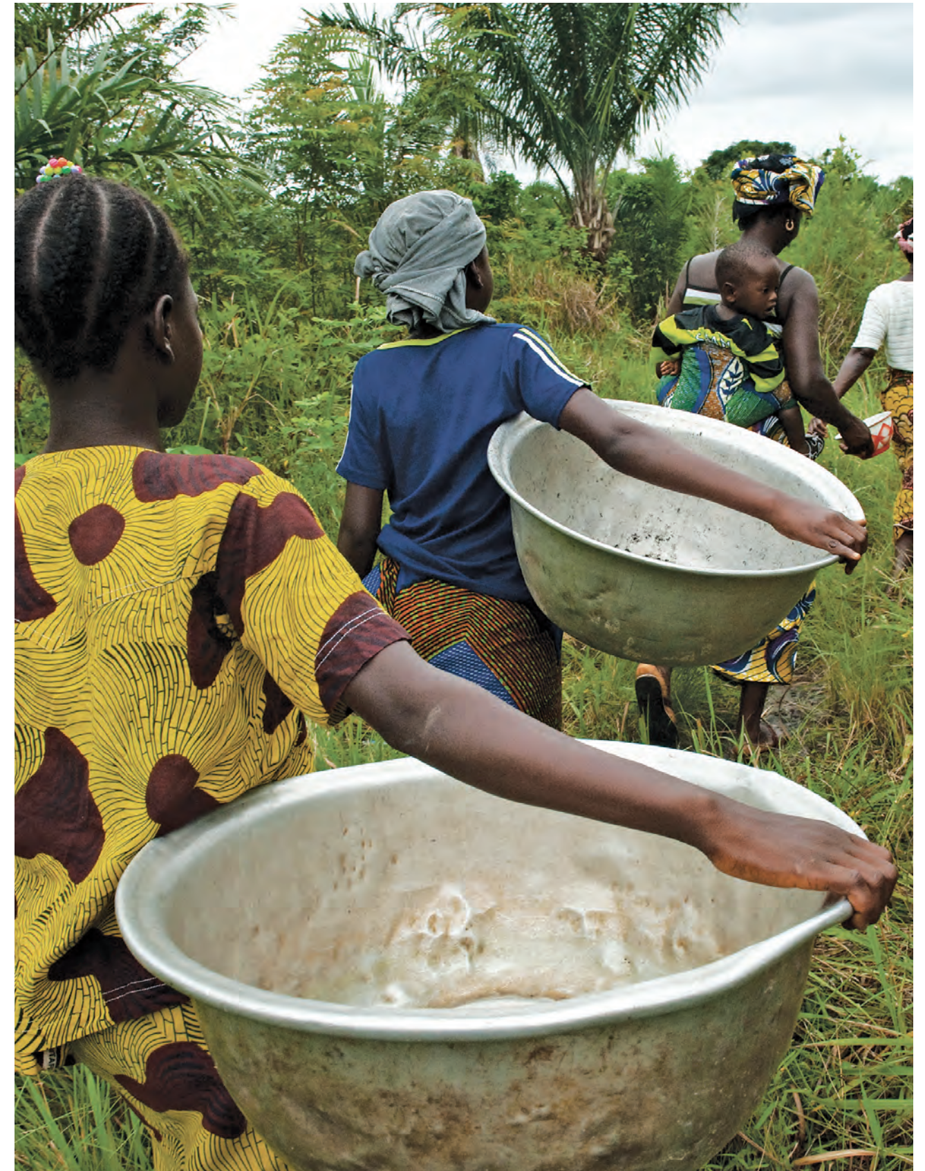
Women benefiting from access to clean, safe water.