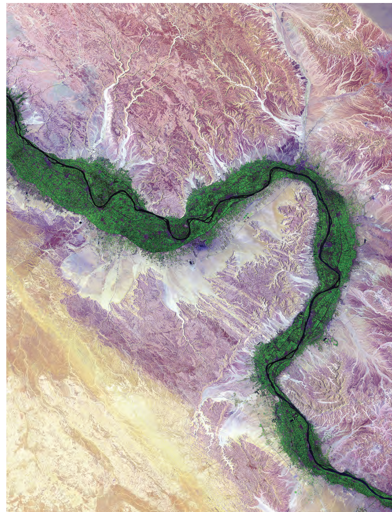
Nile River in Egypt: Green farmland marks a distinct boundary between the Nile floodplain and the surrounding harsh desert.