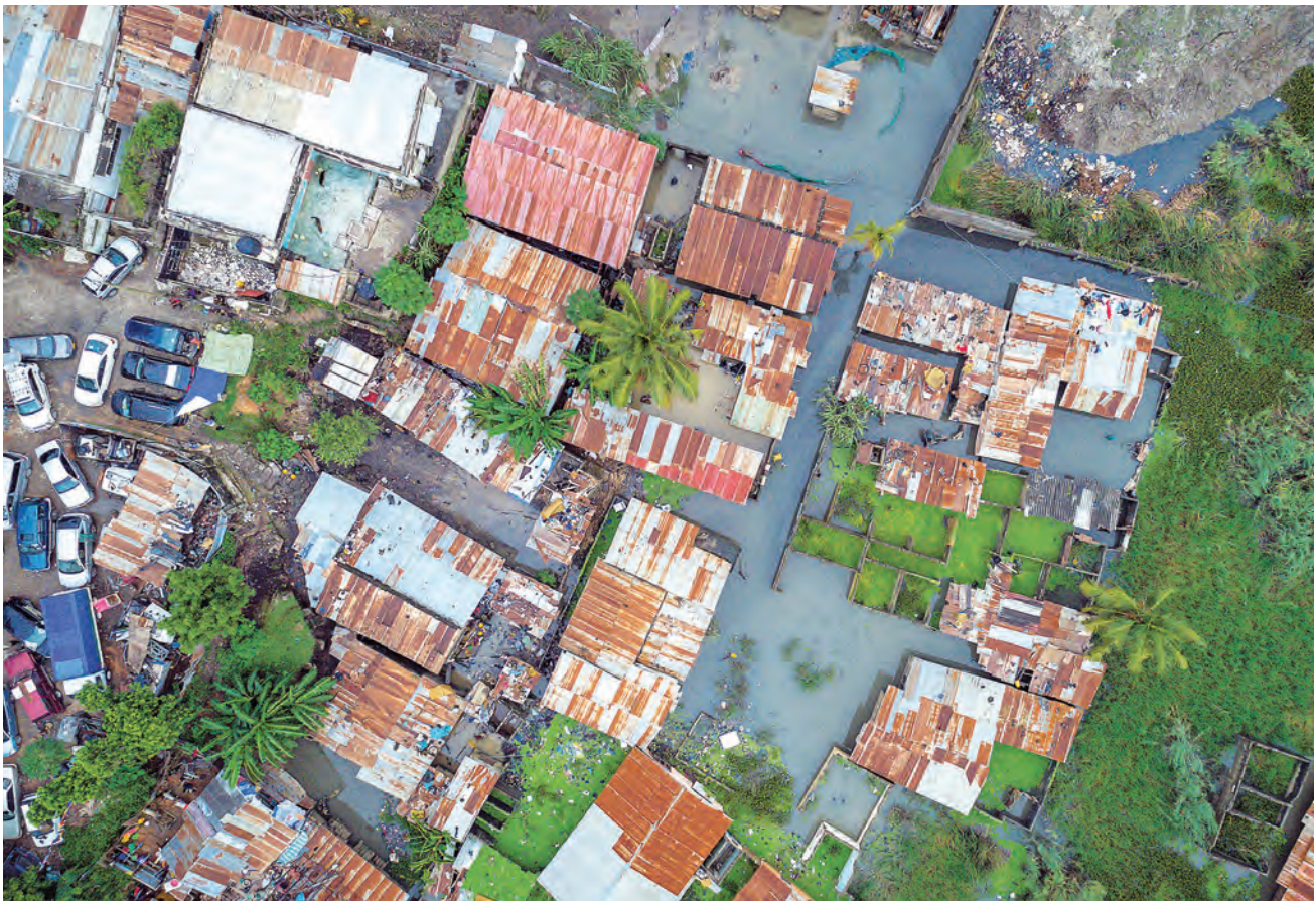
Dar Es Salaam floods aftermath.