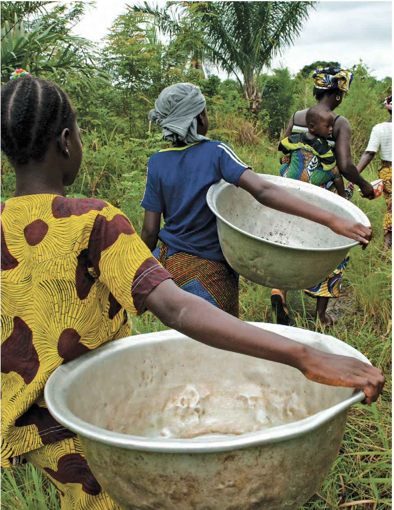
Women benefiting from access to clean, safe water.