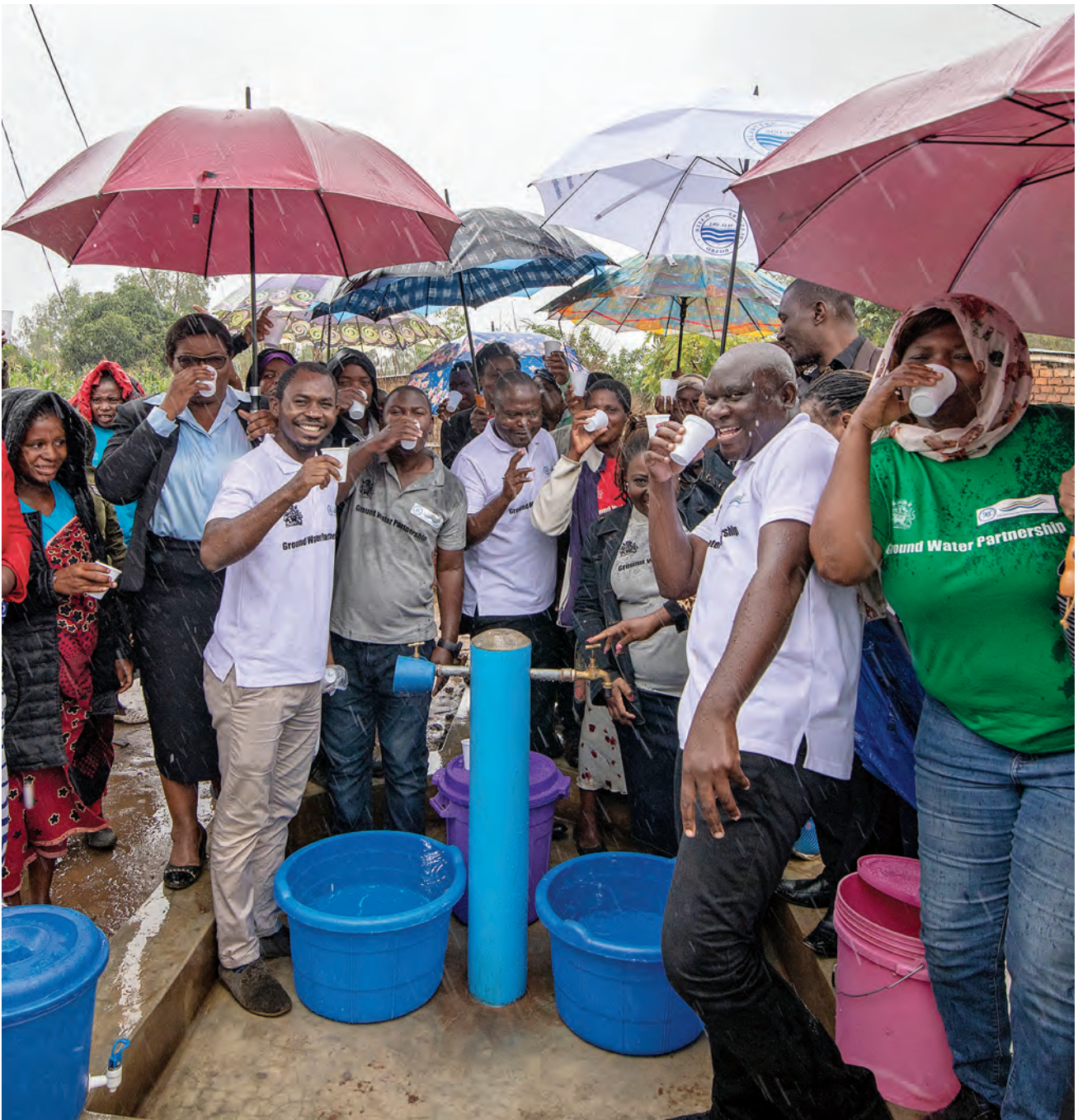
The Chimbiya community tasting fresh and safe water from one of the SADC-GMI's projects, the Chimbiya Water Supply Project, in March 2020, in Dedza District, approximately 60 km from Lilongwe, Malawi.

“It was really challenging growing up,” he says. He wants to help people in communities today to have access to safe water that never dries up—and he just might succeed.