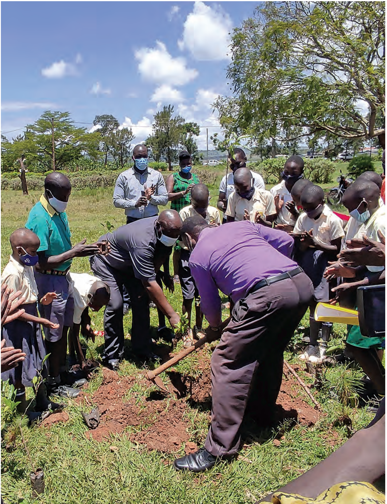
The head teacher and pupils of Prisons Primary School plant trees at school during a Multi-Stakeholder Environmental Conservation Sensitization program organized by the Nile Basin Discourse Forum on Nile Day 2021 in Jinja, Uganda.