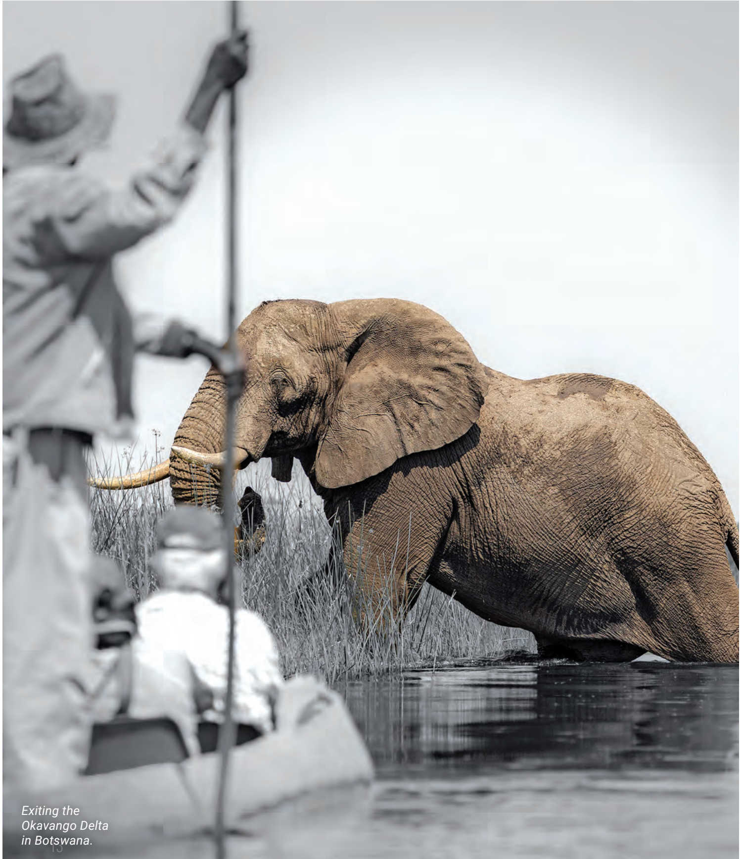
Exiting the Okavango Delta in Botswana.