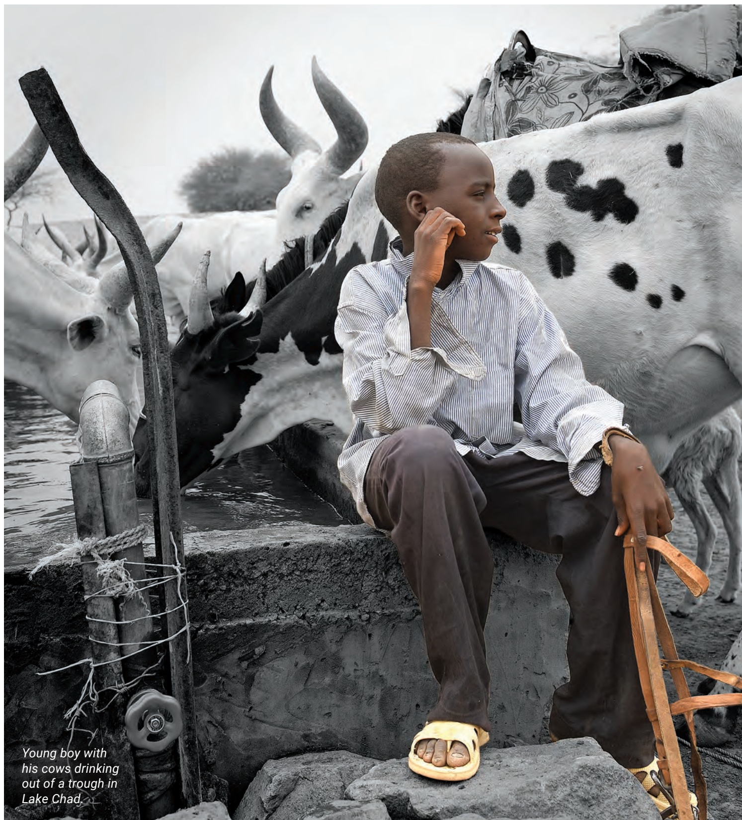
Young boy with his cows drinking out of a trough in Lake Chad.