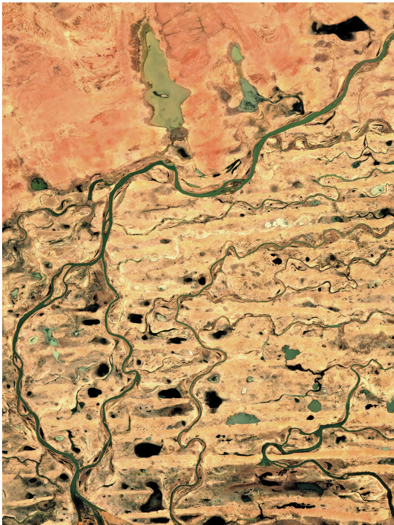
The Niger River and Inner Niger Delta in Mali as seen from space, containing modified Copernicus Sentinel Data (2019).