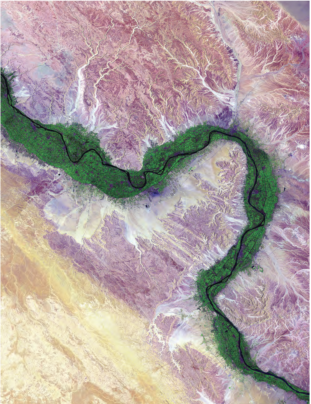
The Nile River in Egypt: Green farmland marks a distinct boundary between the Nile floodplain and the surrounding harsh desert.