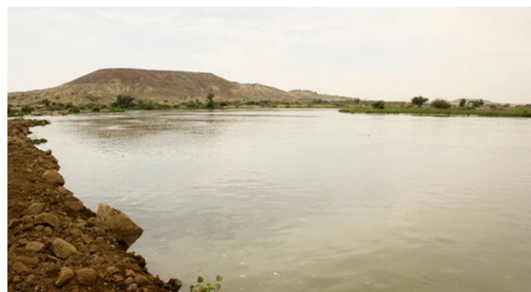
Kandadji Dam site, northwest of Niamey, Niger.

Project components were qualitatively analyzed and matched to adaptation activities included in the World Bank's Climate Change Adaptation and Mitigation Co-benefits Tracking: Guidance Note for the Water Sector (Version 4). 31 CIWA activities that increase resilience of the project (and the infrastructure created by the project) or of the communities benefitting from the project were included. The Guidance Note groups adaptation activities into five categories: (i) sanitation and wastewater management; (ii) water supply; (iii) flood protection; (iv) wastewater collection, transportation, treatment, and disposal; and (v) general water, sanitation, and flood protection and miscellaneous. Table 5 shows the Guidance Note's list of potential adaptation activities/indicators and their categories (Box 2.1 in the Guidance note). This assessment used this list but added additional adaptation activities that were identified by CIWA – (vi) dam safety and (vii) drought risk management—to reflect the focus of CIWA operations on these climate adaptation sectors. These are indicated in Table 5.