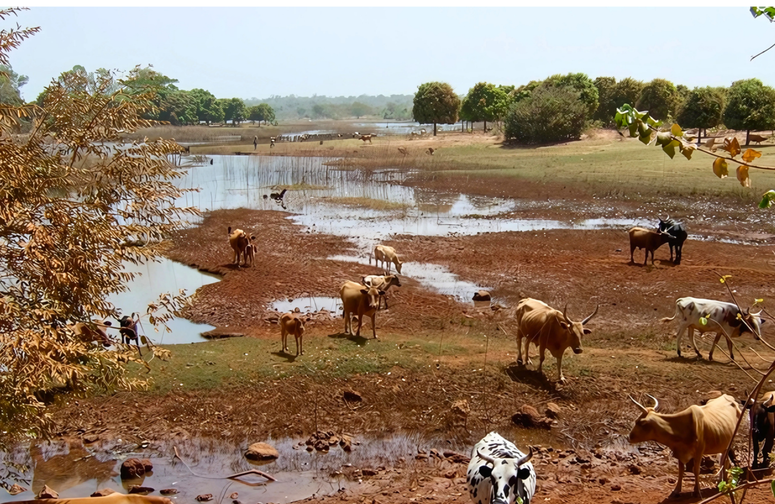
Cattle grazing beside the Sélingué reservoir, Mali.

No CIWA operation or activity directly implements significant GHG emissions reduction. Rather, almost all climate mitigation results are linked to CIWA's influence on downstream or concurrent lending projects. As shown in Table 1, climate mitigation influenced by CIWA operations included four mobilized and two potential hydroelectric stations. The cumulative installed capacity of mobilized CIWA-influenced hydropower investments amounts to 2,379 MW, which corresponds to about 5.66 percent of Africa's overall hydropower capacity (42 GW). These are the most readily quantifiable of CIWA's activities; CIWA also has operations and influenced projects that incorporated solar-powered pumps for groundwater extraction or irrigation, but these are generally on a very small scale and not quantified for this report (see Table 3). 27 The active BETF, Untapping Resilience: Groundwater Management and Learning in the Horn of Africa's Borderlands, is on track to support larger investments in groundwater solar pumps across the HoA borderlands through the World Bank's HoA Groundwater for Resilience program. CIWA's other mitigation activities include influencing potential investments in grid interconnection expansion supporting accounting and management of biodiversity, wetlands, and ecosystem services, and potential investments in watershed management and rehabilitation.