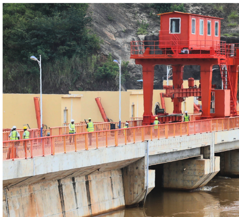
Regional Rusumo Falls Hydroelectric Dam, Rusumo, Tanzanian-Rwanda border.

Further potential mitigation investments were identified but not included in the current analysis as they have either not had a feasibility study or not been fully identified. These investments are found under the Nile Cooperation for Results (NCORE) project (including both additional financings), Niger CRIP, and the Cubango-Okavango Resilient Livelihoods Enhancement Program. Further information and data collection will be needed to include these projects. For example, in the case of Cubango-Okavango, the investments relate to 28 potential hydropower projects that have been identified, and although the expected cumulative annual electricity to be generated from these projects is available, individual data on installed capacity and electricity generated for each project has not been disclosed yet. Table 3 highlights the mitigation investments identified among the 41 CIWA-influenced projects analyzed. Only those that are also in Table 1 have been studied sufficiently to be included in the calculations. As investments shown in Table 4 become mobilized, future analyses can add them to Table 1 calculations.