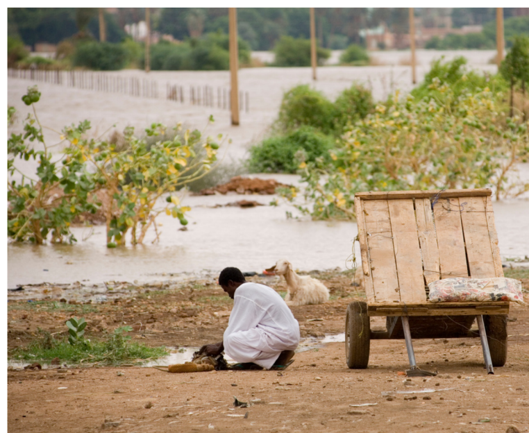
A refugee in Sudan.

In 2020 in the Horn of Africa, locust upsurges occurred, where over 23 million already food-insecure people were living, many already affected by violent conflict and droughts. Intense locust outbreaks are linked to climate change and the increased frequency of extreme weather events. 6 Outbreaks coincided with cyclone Mekunu from 2018, and warmer weather combined with heavy rains at the end of 2019. Large swarms were born at the start of 2020 in Ethiopia and Somalia and spread rapidly to Kenya, Uganda, Sudan, and other countries. 7 It was estimated that by the time the swarms receded in 2021, they had damaged hundreds of thousands of hectares of crops in Ethiopia and Kenya. Eighty-four percent of farms in Puntland, Somalia were affected by desert locusts, destroying 61 percent of fruit and vegetables. The World Bank has allocated US$500 million to support countries affected by the desert locusts. 8