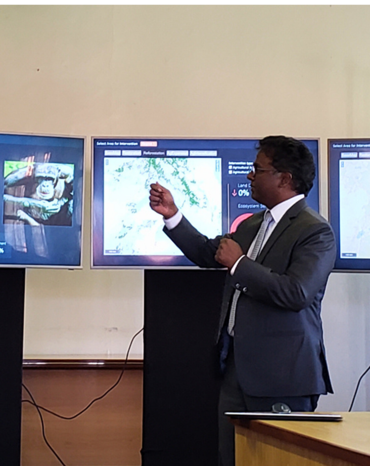
Decision Theater as part of the Nile Cooperation for Climate Resilience project at the Nile Basin Initiative Secretariat in Entebbe, Uganda.

In the second line of assessment, CIWA-influenced investments were analyzed for their climate adaptation benefits. CIWA operations were screened for components that specifically facilitated the identification or preparation of new investments. This can include facilitation of investment dialogue, the development of investment plans, or the financing of project preparation studies (e.g., feasibility studies, ESAs). The identified influenced investments were matched against the list of adaptation activities from Table 5.