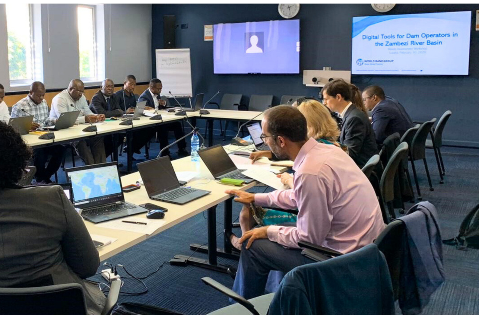
Needs Assessment Workshop for the development of Decision-Support Tools for Optimization of Zambezi Dam Operations (under the CIWA-funded Southern Africa Drought Resilience Initiative (SADRI)).

In the Nile River Basin, Horn of Africa, Zambezi River Basin, and Lake Chad Basin, CIWA supported the design of hydrometeorological monitoring systems and/or generation of hydromet data through remote sensing to enhance water resource management through better data on basin water availability and use. In the Nile and Zambezi River Basins, CIWA supported the establishment and/or maintenance of decision-support systems (DSSs) that have been used by RBOs to provide information services to its member countries and, in some cases, inform the identification of investments. In Southern Africa and the Nile River Basin, CIWA supported the development of information systems on floods and droughts (in the Nile River Basin) and groundwater (in Southern Africa) shared with member countries through integrated knowledge portals. In addition, in Southern Africa, SADRI supported the development of drought resilience profiles for SADC member states and a regional profile that captures commonalities and key opportunities across the 16 countries while also providing information that supports the identification of regional drought risk management investment opportunities, including in ecosystem services and biodiversity.