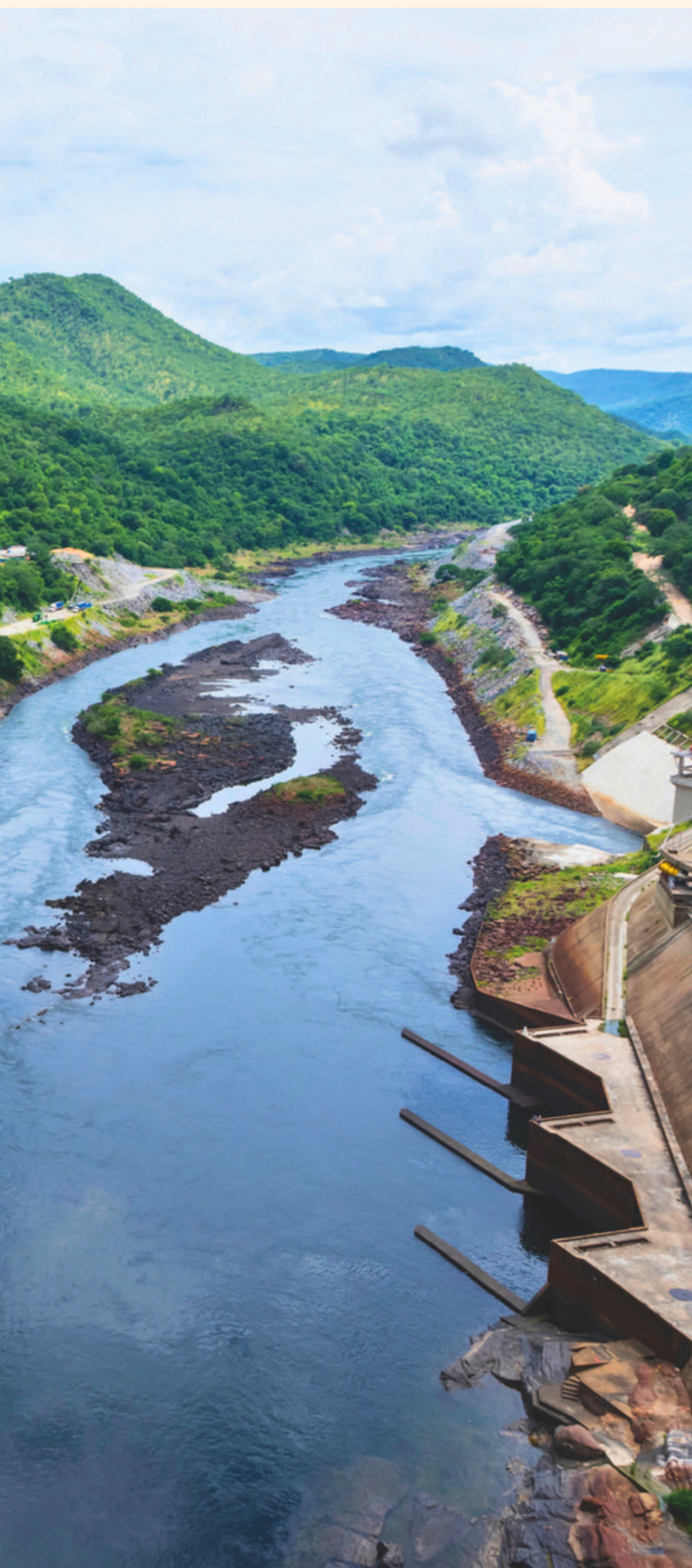
The outflows into the Zambezi river from the hydroelectric power stations either side.