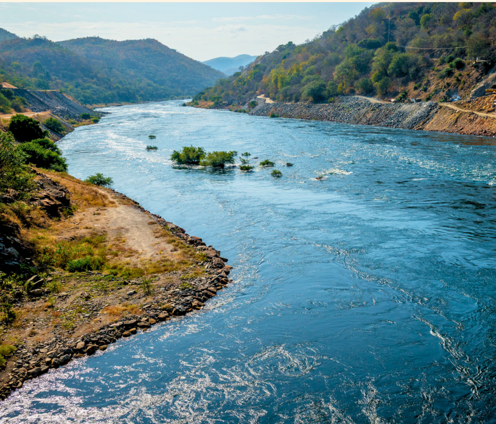
Earthworks on the banks of the Zambezi River, Zambia.

their responses to the changing climate and better manage shared resources to make their populations more resilient. Considering the ongoing impacts of droughts, the Kariba Dam has helped spearhead cooperation and discussion between Zambia, Zimbabwe, and the respective power utilities in terms of optimizing available water resources. CIWA support to the ZRA also included the financing of a feasibility study and ESIA for the Batoka Gorge HES. This potential joint project upstream of Kariba would contribute to improving electricity access, reducing blackouts, and improving regional energy security.